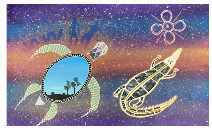
2022 Theme: Restoration. Two people on a journey together towards becoming reconciled and restored to each other.

Last year we had some truly amazing artwork. This program gives people a unique opportunity to demonstrate their specific talents and skills in response to our theme.