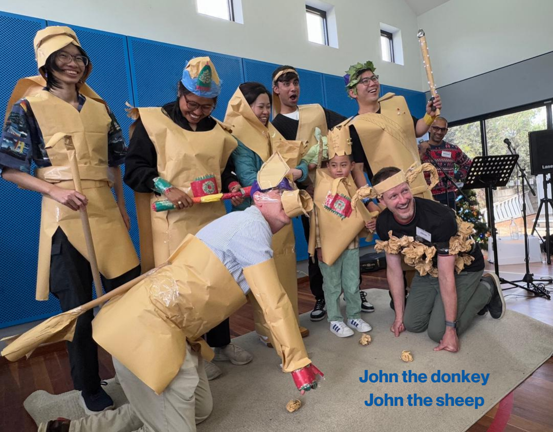
John the donkey John the sheep