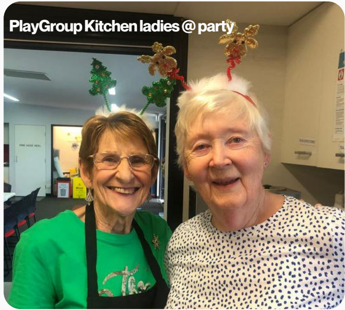
PlayGroup Kitchen ladies @ party